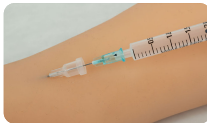
Insert the cannula into the needle. 캐놀라를 바늘에 삽입