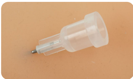
Punching medical procedure area. 시술 부위 천공