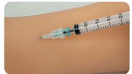
Filler injection. 필러주입